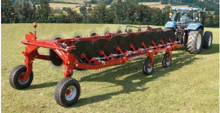
TRANSPORT POSITION Machine in transport position on the road